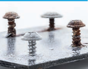
Direct Screwing in Plastics and CFK