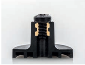
Threaded Inserts and Bolts