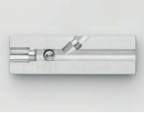
Closing and Sealing Systems