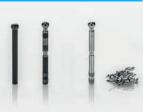
Non-cutting Alternative for Turned Part Production