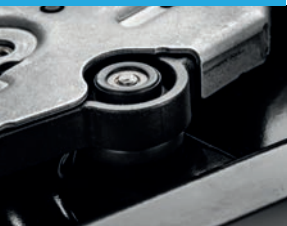
Bearings and Dampers